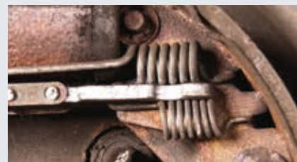
Old coil springs

When repairing the brakes of vehicles that are more than 48 months old, we also recommend that you have the retaining spring replaced.