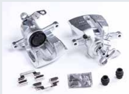
Brake caliper with accessories

In addition to detailed assembly instructions, our boxes therefore contain all required accessories, such as sliding plates, metal plates, screws, plastic caps, springs and lubricants.