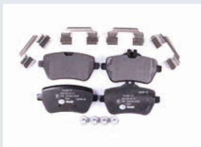
Brake pads with accessories