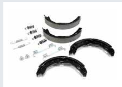
Brake shoes with accessories