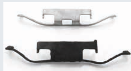
Top: New brake caliper spring Bottom: Brake caliper spring with considerably reduced clamping force after approximately 6 years of use, including extended periods of non-use.