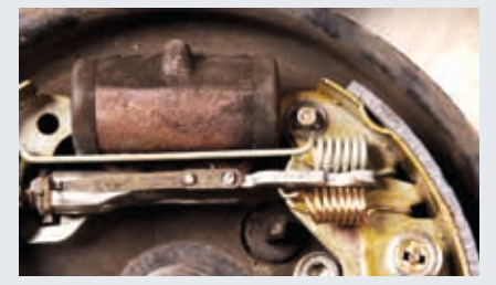
New coil springs and brake shoes

Worn coil springs in drum brake systems are a serious source of disturbance. Replacing them in good time ensures high spring tension, which is imperative for the brake to operate quietly and without vibration.