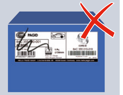
Part number crossed out