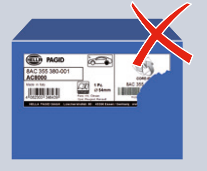
Barcode partially torn off