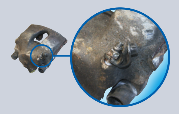
Guide bushing damaged