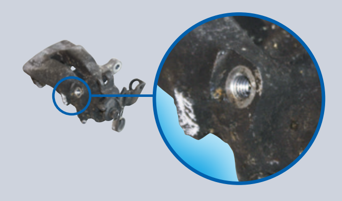
Housing damaged, spring mounting broken off