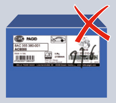
Barcode written on, e.g. with date